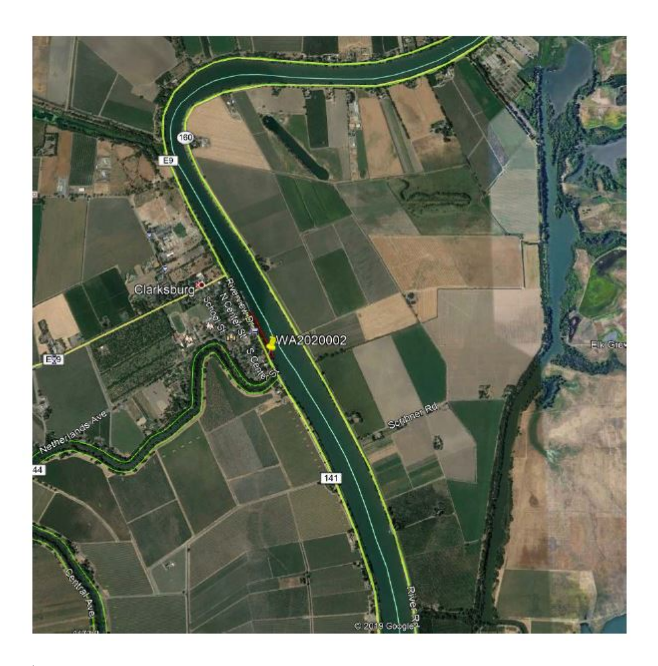
2) Location map